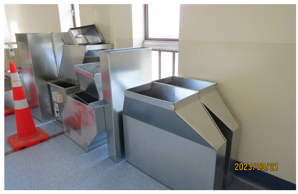
Parts of the air handling system ready for installation.