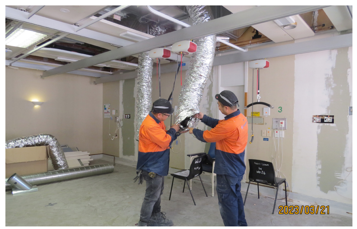
Pipework for the new air handling system being installed in the ceiling.

When the hospital was built back in the early 1970s, windows provided the ventilation system. These do not provide the air control required to manage air-borne infections such as COVID-19.