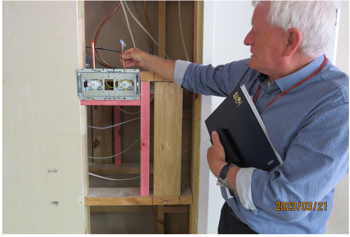
Medical vacuum and oxygen systems being installed at each bedside.

The opportunity is also being taken to upgrade the Ward's lighting while it is empty of patients, and fit out two rooms so they are capable of supporting dialysis patients who are in hospital for other medical conditions.