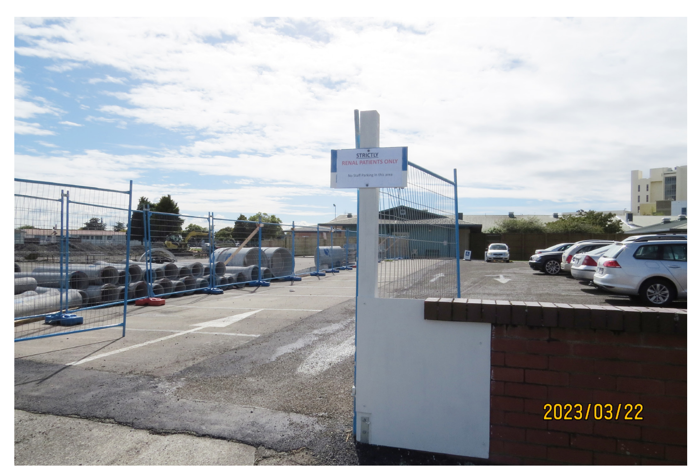
New car park for renal patients, accessible from Heretaunga Street.