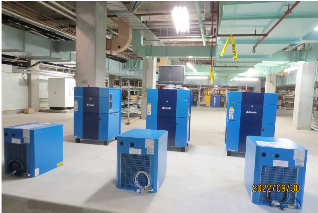
New Medical Air system located in the hospital's basement.