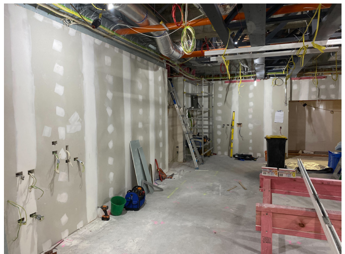
On rooftop, plant installation continues and fit out of theatres and cath lab coming together.