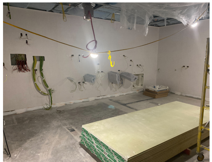
The concrete foundations of our Acute Mental Health Unit nearing completion and SPIRE fit-out of theatres continue to progress on track.