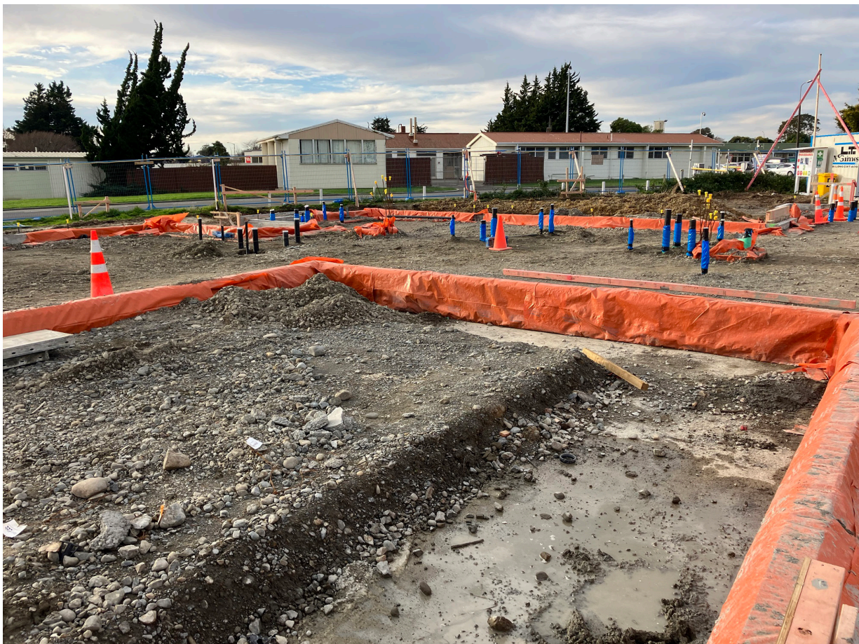
Site works continue in readiness for Stage 3 foundation.

You can follow the progress of these projects on our website www.projects.mdhb.health.nz or by scanning the QR code.