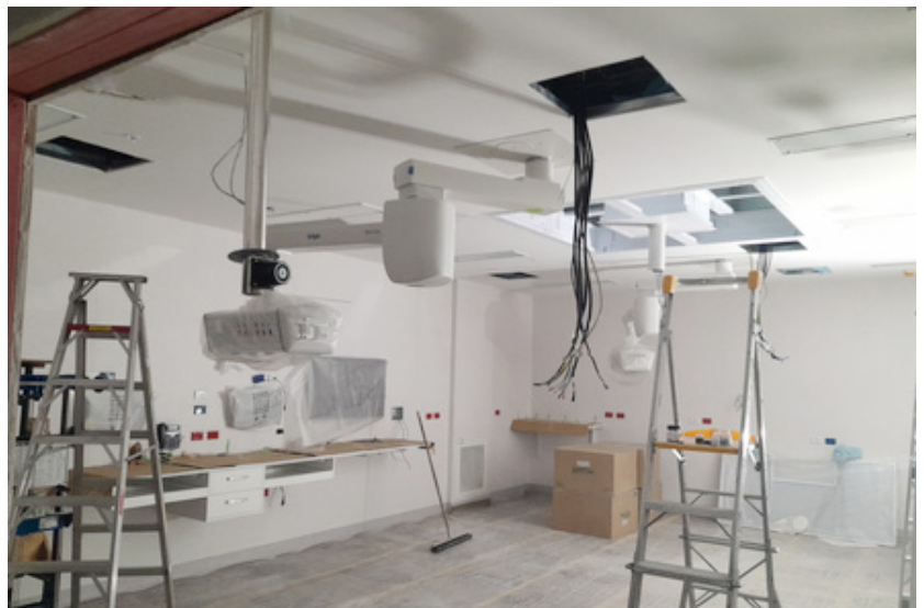
Theatre pendants being installed.