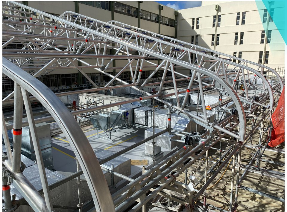
Scaffolding and tent being removed from rooftop.

Work to install the air handling units and other plant on the rooftop is all but complete. This work occurred under a large tent which is now being dismantled. Scaffolding is also being progressively dismantled and moved offsite.