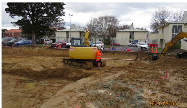
6 September 2023

Stage 2 and 3 will get underway in future years.