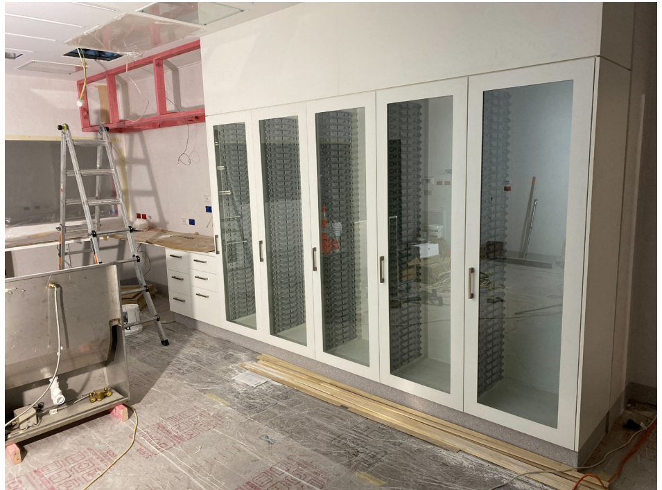
Fit-out of cath lab underway.

The introduction of this service is a significant asset for the region, where appropriate patients and whānau in the community will no longer need to travel to Wellington Hospital for time-critical cardiac procedures.