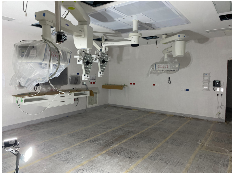
Pendants installed in new theatres.

Construction works are scheduled for completion by the end of October and work then begins in getting these cleaned, equipped, clinical equipment commissioned and the area blessed. This involves many services, including theatre, materials management, cleaning, digital services, clinical engineering, to name but a few.