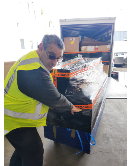
First load of cardiac cath lab equipment arrives.

Our new Acute Mental Health Unit continues to draw interest as the building structure takes shape, changing daily. The first section of roofing is about to be laid.